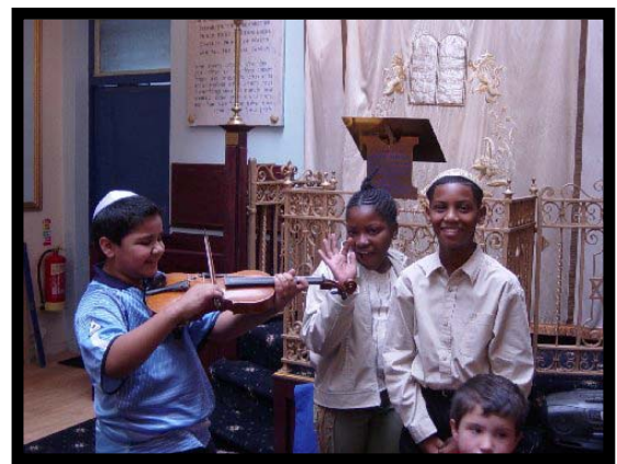
Children enjoy an InterFaith Klezmer workshop at the Congregation