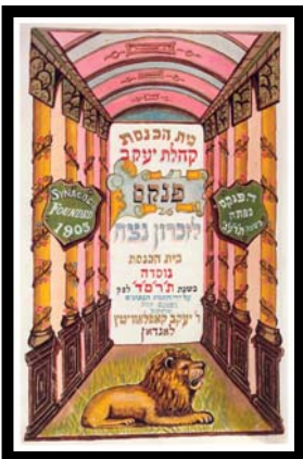
The Founding Document (1903)