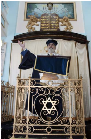
Image (right): The Chief Rabbi Dr Jonathan Sacks gives an impassioned speech at the centenary of the CoJ in June 2003.

Today we are diverse, with members from all types of trades and backgrounds. We are affiliated to three burial societies,, Adath, Chesed Ve'emeth and Federation, but we are most proud of the fact that we retain our independence, reflected by the fact that the synagogue is owned, managed and maintained by members of the community. Kehillas Ya'akov "is a remarkable survival ... and is all the more exceptional for continuing in use as a synagogue" (English Heritage Report).